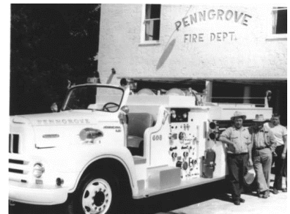
Penngrove Fire Department, Penngrove, California, 1958

Back at the firehouse, the women's auxiliary, took care of the telephones and the many other tasks involved in the fire department operations.